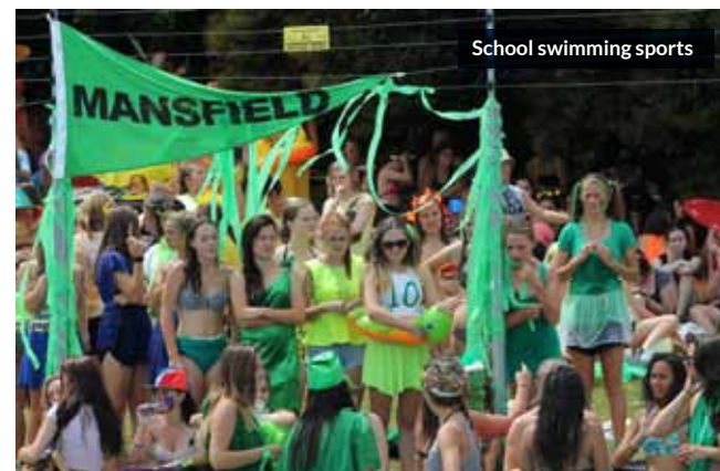
School swimming sports