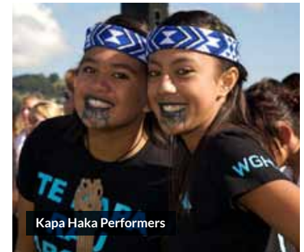
Kapa Haka Performers