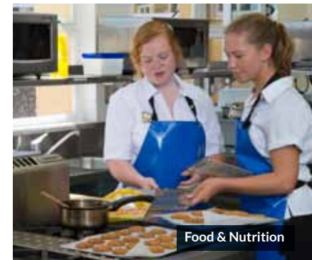
Food & Nutrition