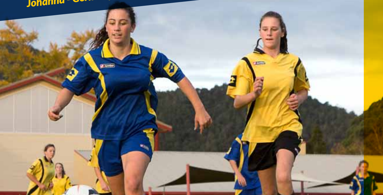
Football match at school