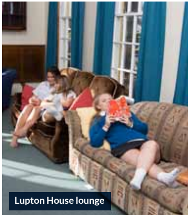
Lupton House lounge