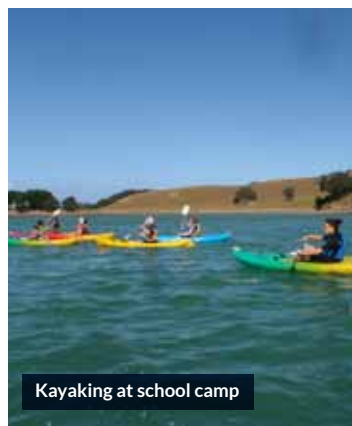
Kayaking at school camp

Students can also enjoy forest walks and swimming and surfing at local beaches, as well as an abundance of adventure sports like bungee jumping, white water rafting and skydiving.