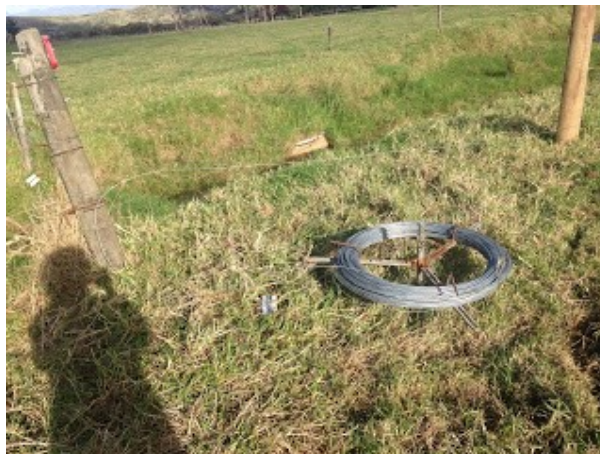
Elle out at work on the fenced off waterway.