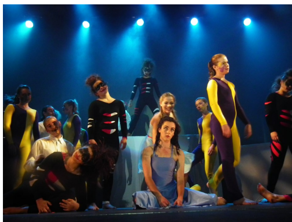
WGHS Whangarei ASB 2014 Stage Challenge winners