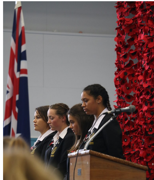
Head and Deputy Head Girls conducting assembly and Anzac commemorations.