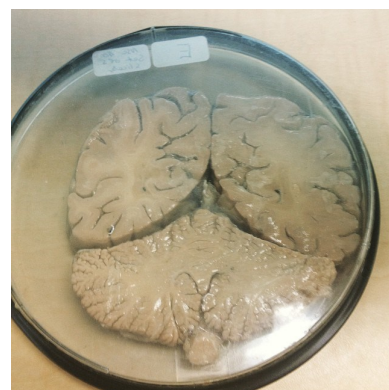
Sample of a brain