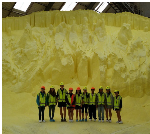
Sulfur at the Ravensdown Fertiliser Plant