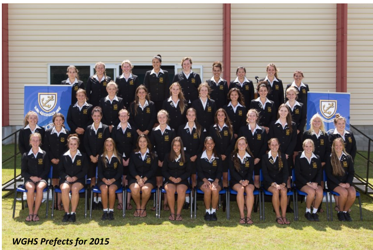
WGHS Prefects for 2015

You may remember that towards the end of last year we changed the name from form class and form teacher to whanau class and whanau teacher. This better reflects the role of this class which stay together for five years and are the "family" at High School. There will be some structured time where students will be taught skills such as time management and study skills and also time